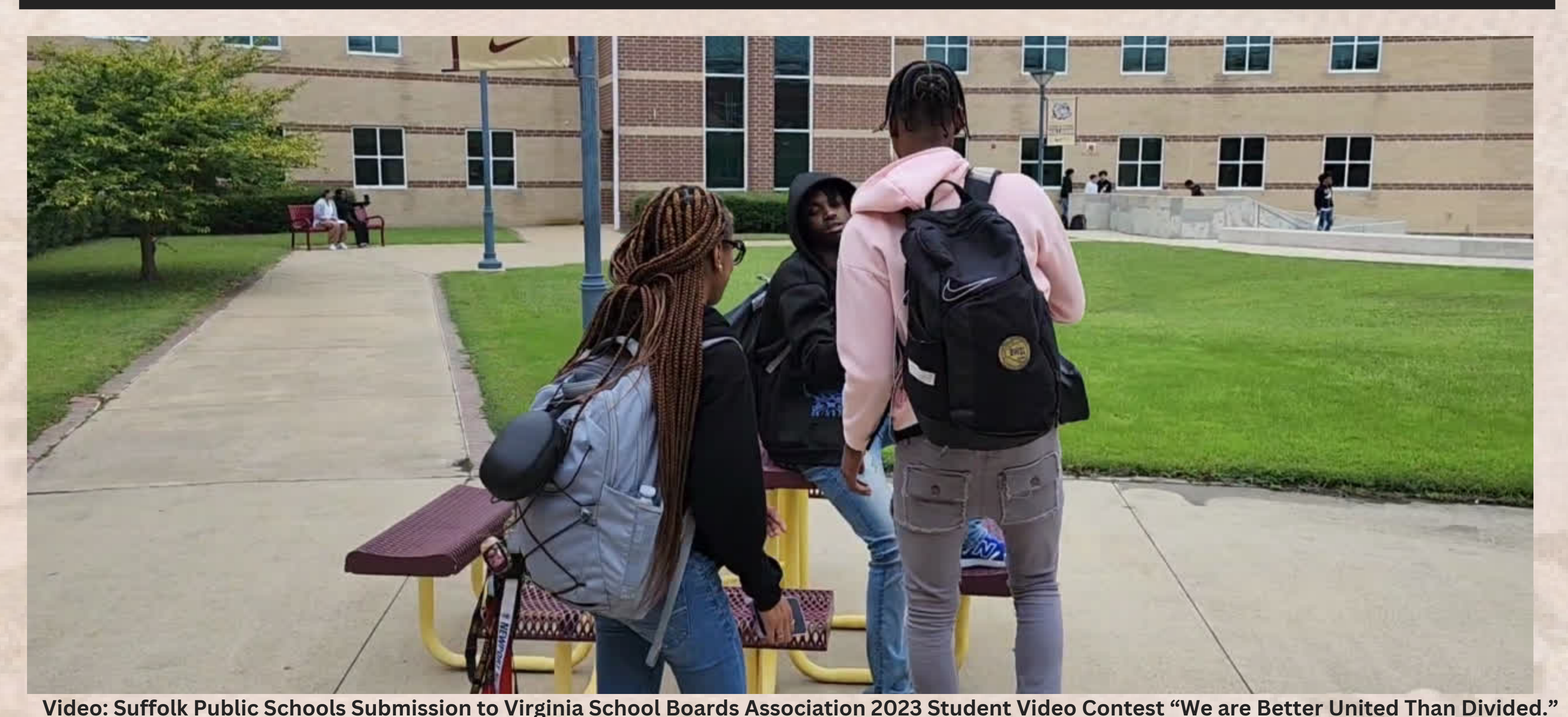
rideo. Surrotk i distre seriodis submission to virginia seriodi Boards Association 2025 stadent video contest. We are better officed i man bivided.